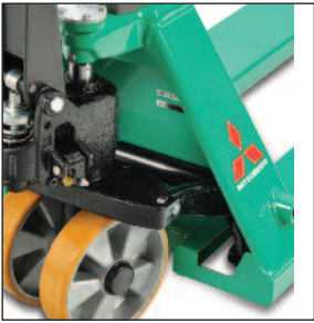
Controlled lowering valve