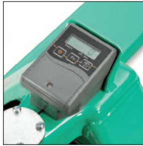
Optional Load Weight Indicator (W)